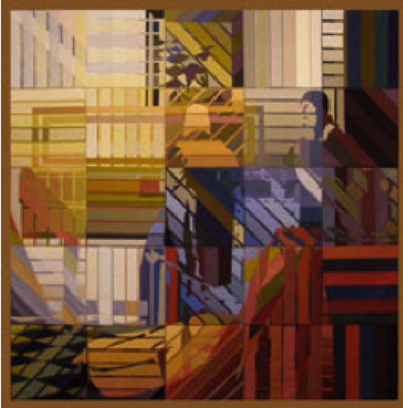
Self-Reflection, pieced, appliquéd cotton