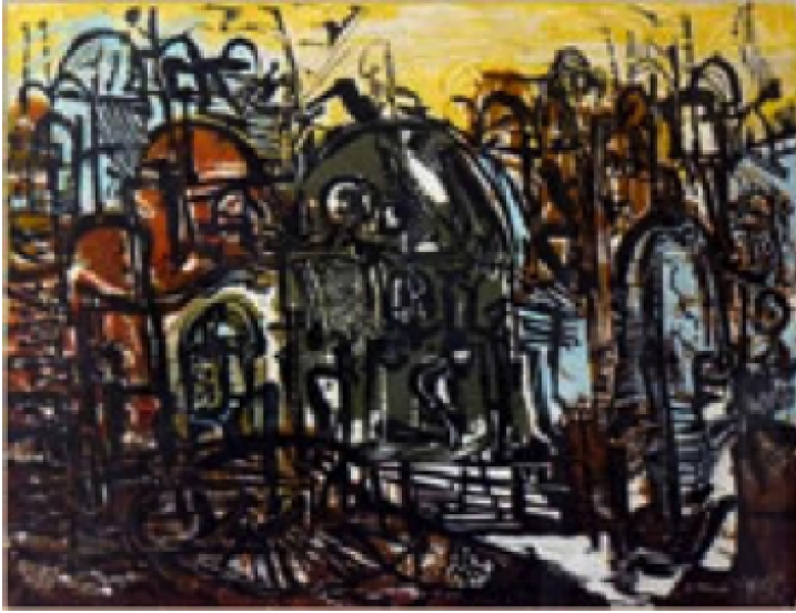
Rudy Pozzatti, Carnavale, woodblock print