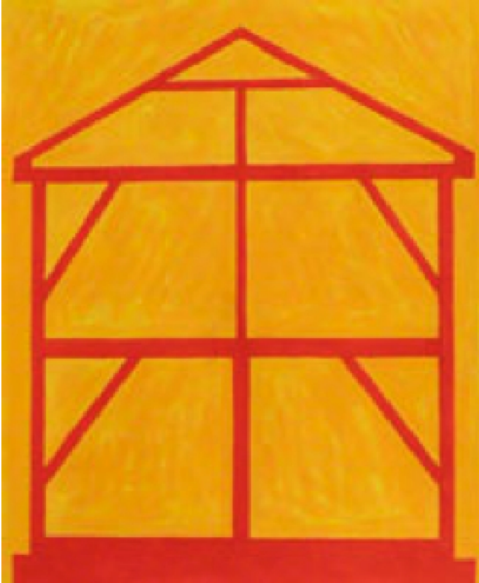
An American Frame, watercolor