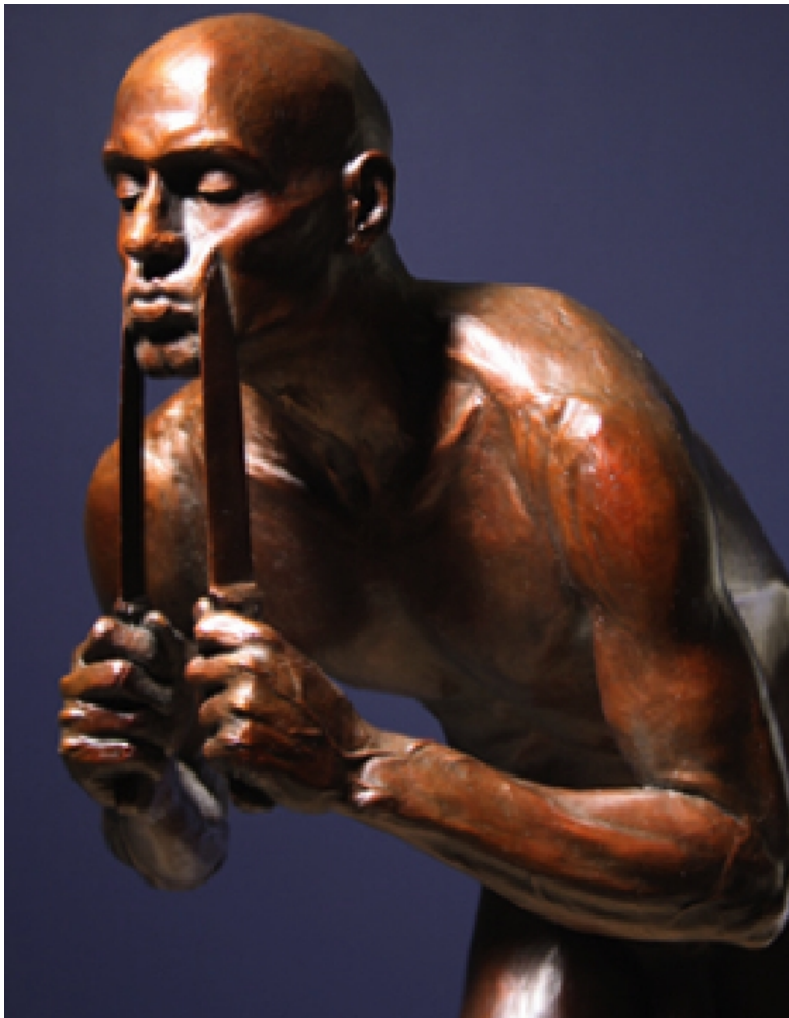
Honey Kiss, Vinegar bronze and stone